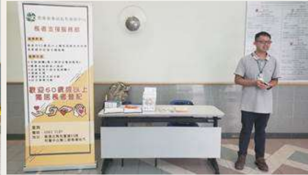
SAGE Eastern DECC 耆康會東區長者地區中心