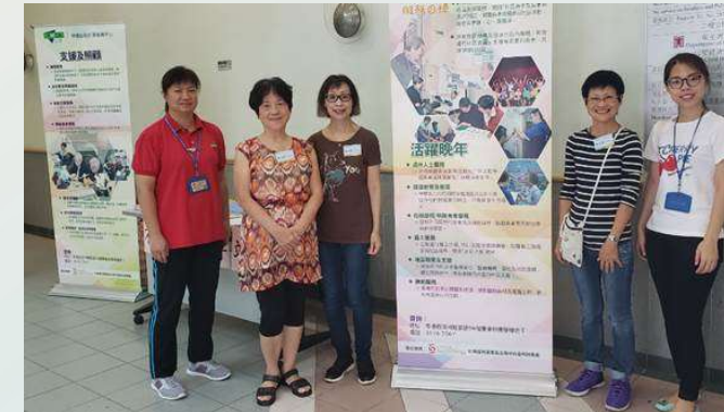
YWCA Ming Yue District Elderly Community Centre 明儒松柏社區服務中心