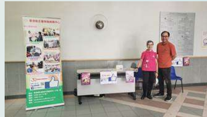
The Endeavourers HK Bert James Young Neighbourhood Elderly Centre 香港勵志會陳融晚晴中心