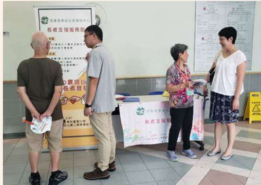
SAGE Eastern DECC 耆康會東區長者地區中心