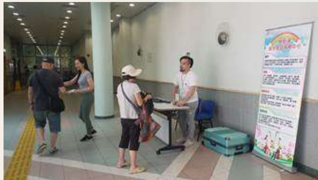
Quarry Bay Integrated Family Service Centre 鰂魚涌綜合家庭服務中心